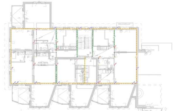
Load transfer plan