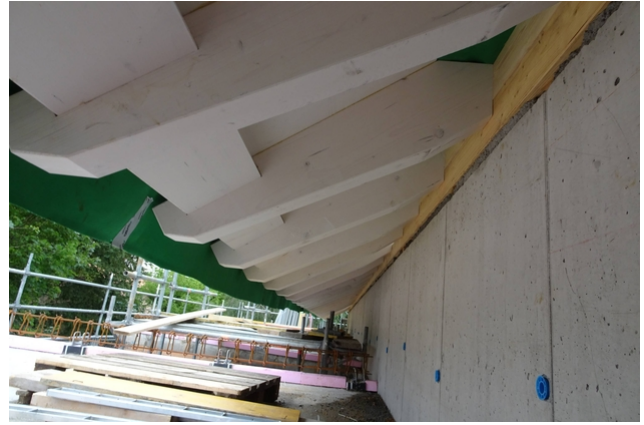
Canopy eaves side with sticher