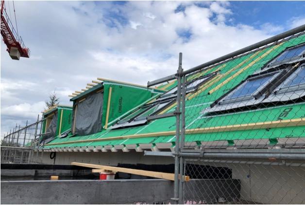
Increase in the construction phase