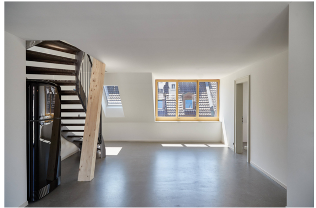
Visible brace in the apartment