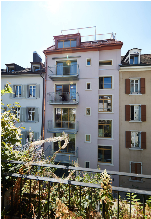
View building from outside