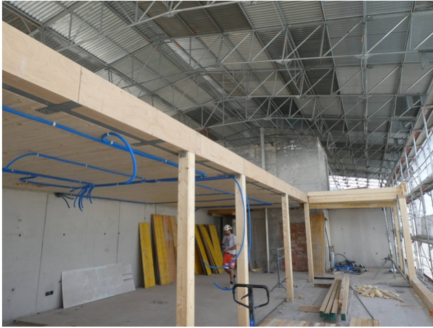
Addition under the emergency roof