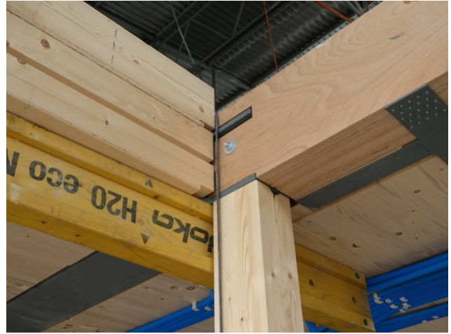
Beams made of beech wood