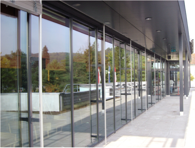
Entrance area restaurant