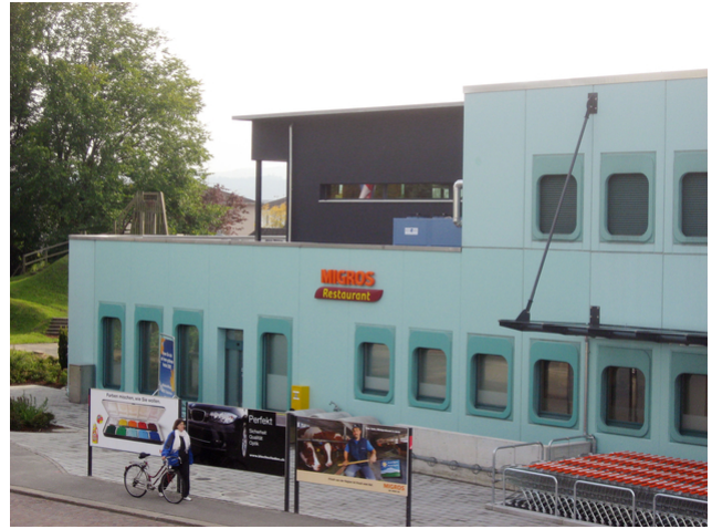
View north side with light band