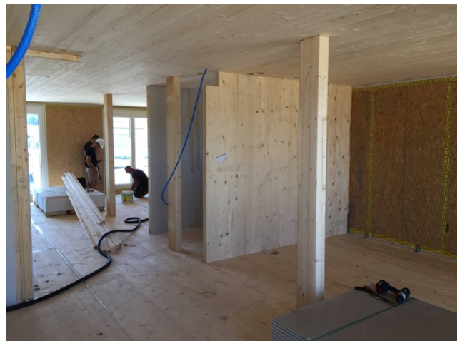
Supports and slabs in the shell