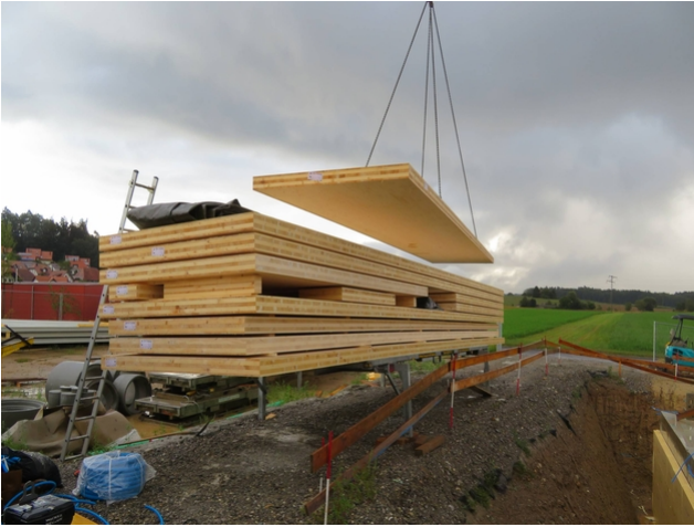
Delivery of CLT panels to the construction site