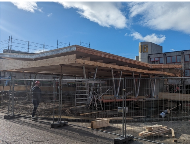
Construction site impression