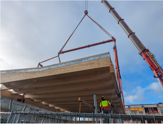
Installation of the panels, which are glued to the intermediate structure.