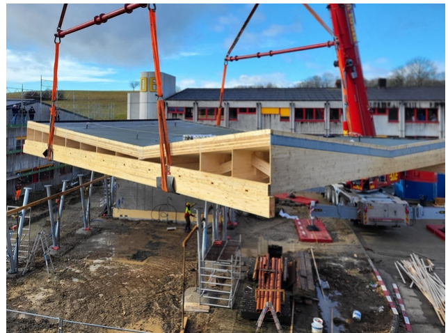
The spectacular folding/angled roof is lifted into place.