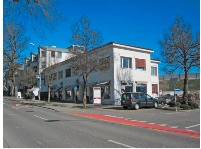
The commercial building before the extension