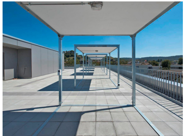
Spacious roof terrace with view of Lenzburg