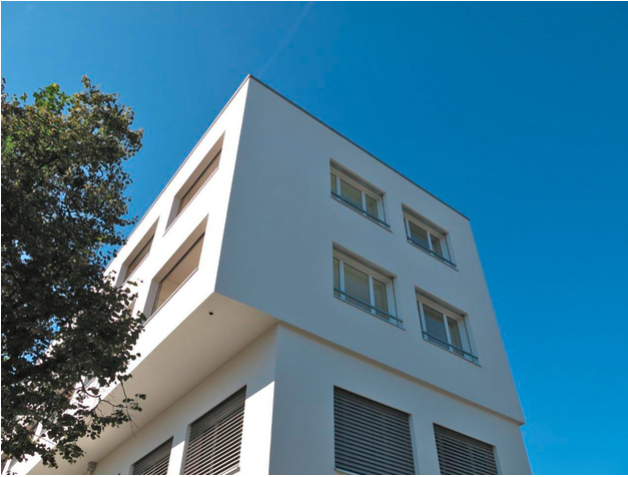
The striking overhang emphasizes the boundary between old and new