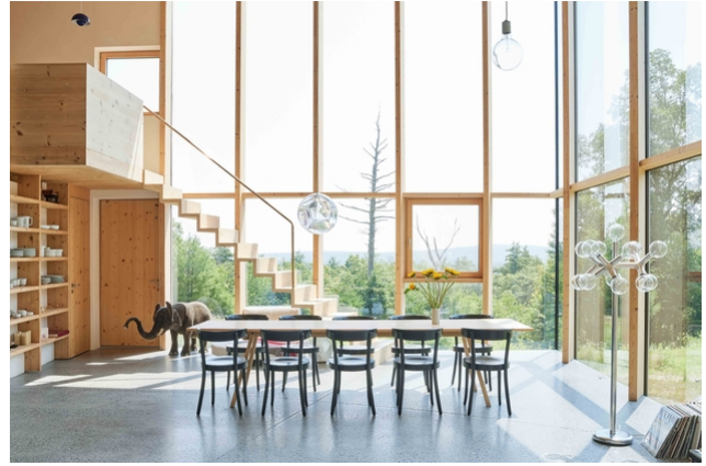
Interior view of the building