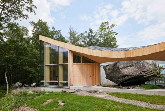
The stone is the center of the building