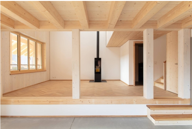
Interior view living room