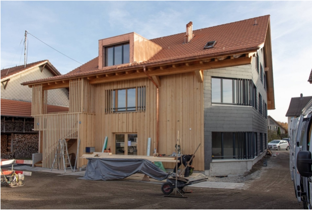
Fire protection facade to the neighboring house