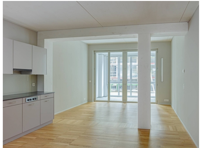
Interior view of the finished apartment

Connection of storey ceiling to staircase core