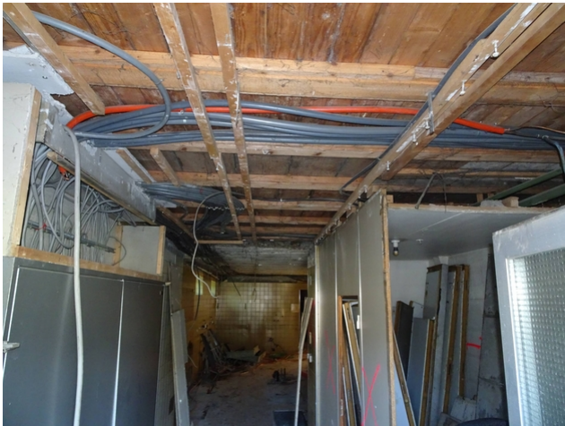
Ceiling before retrofitting