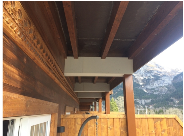
HEB beam clad