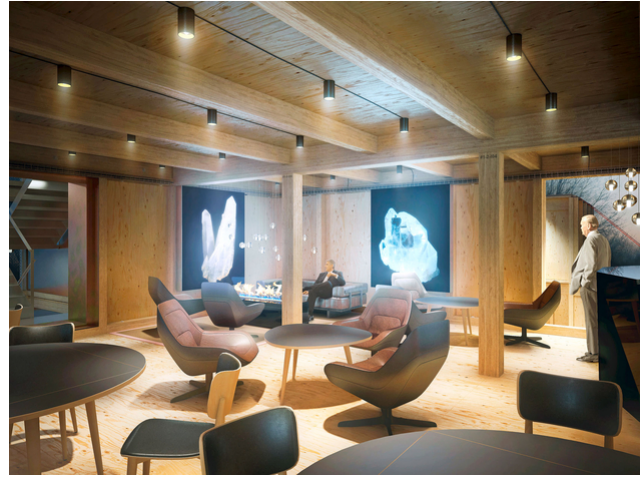
Interior visualization of the lounge