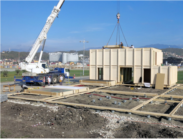
Montage in Sochi