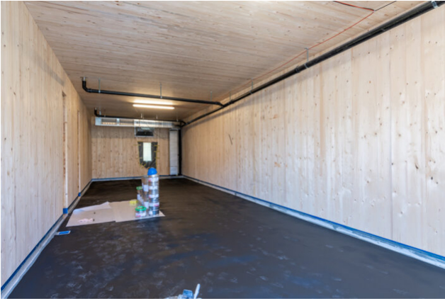
2nd floor