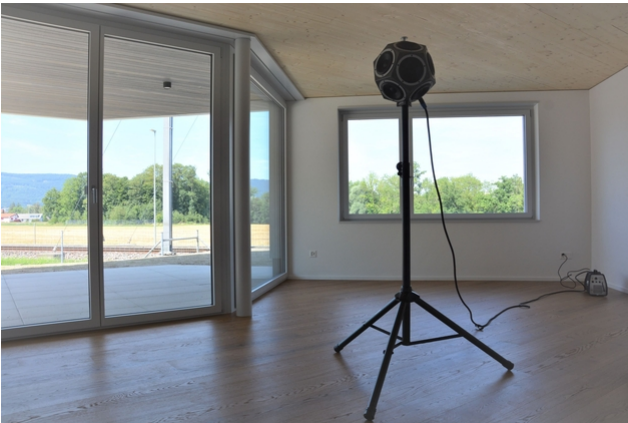
View of column-slab connection and acoustic measurements