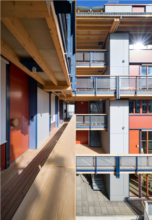
Exterior view of the pergola