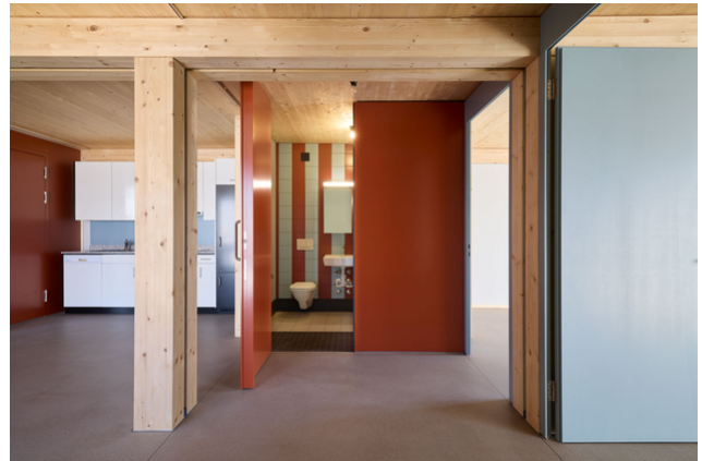
Striking wooden structures in the interior design