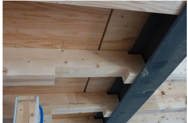
Cutouts for building services installations in the rib elements of the floor slabs