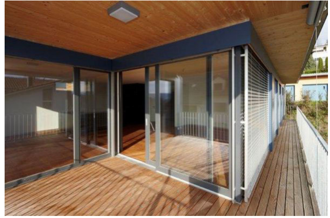
Exterior view south apartments