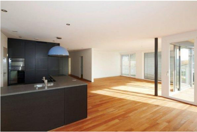
Interior view south apartments