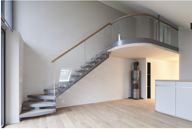
Maisonette apartment gallery