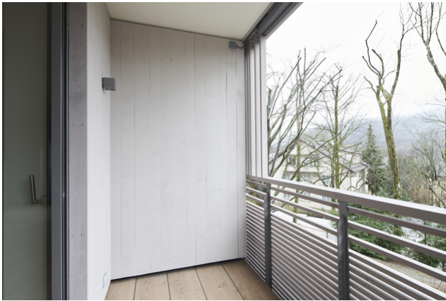
Wood on the facade and balconies