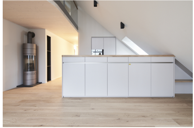
Kitchen area with swedish stove