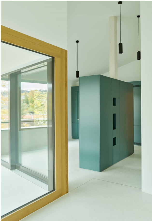
Passage living room - kitchen