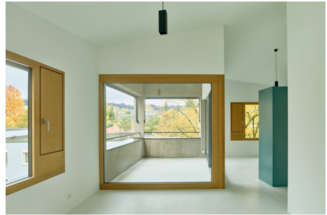
View to the balcony