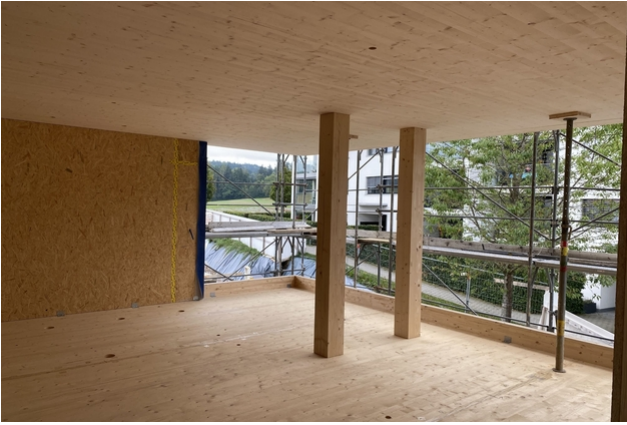
TS3 construction during the construction phase