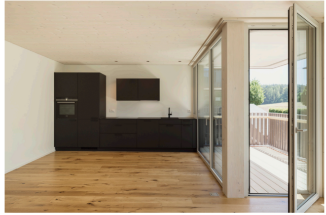
TS3 assembly in its finished state