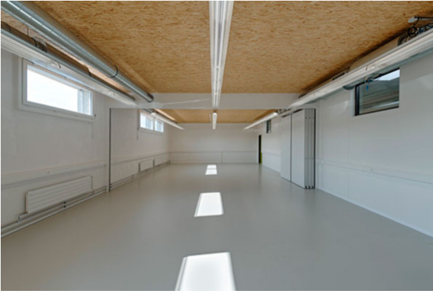
Interior view of the hall