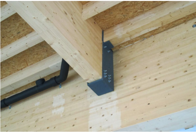
Roof support detail