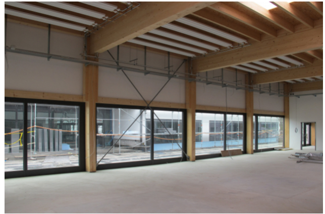
Interior view with glass front