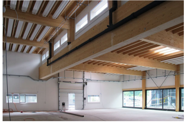
The shell of the hall