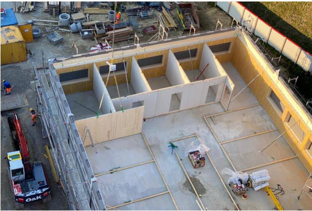
Mounting the interior walls