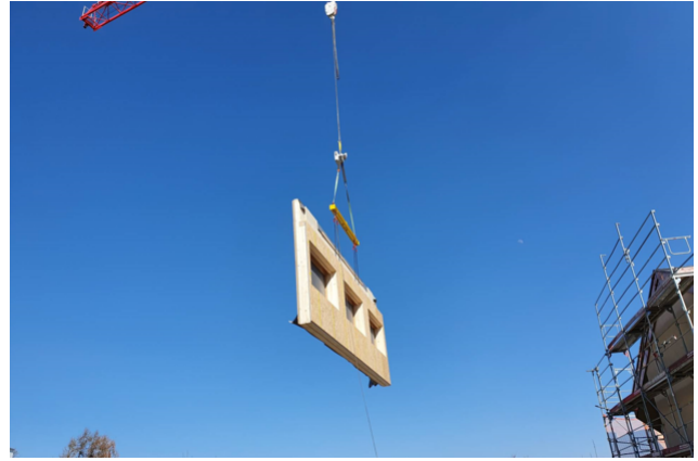
Erecting the wooden construction elements