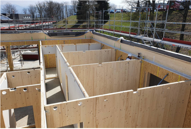
Interior walls in cross laminated timber