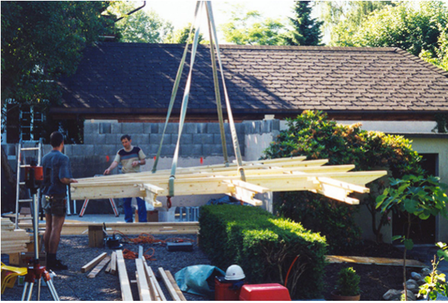
Lifting girder grid