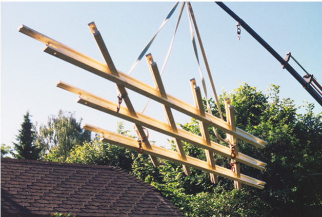
Unloading the beam grate