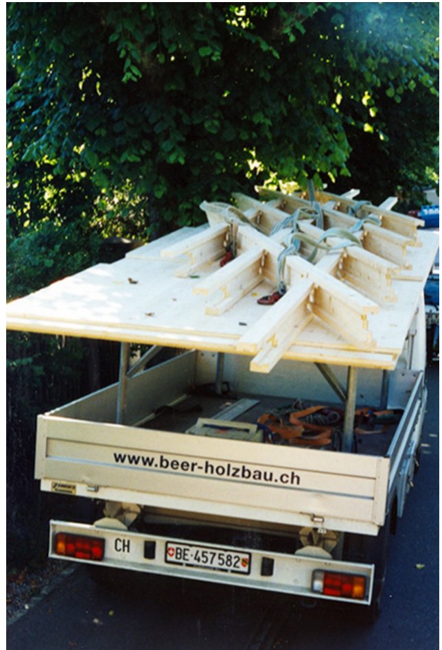
Delivery folded support grate