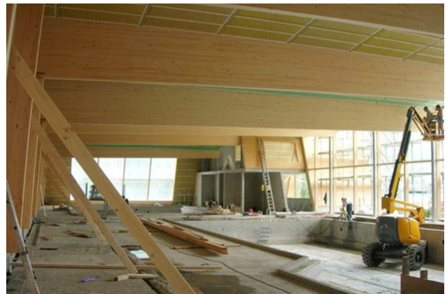
Shell interior view