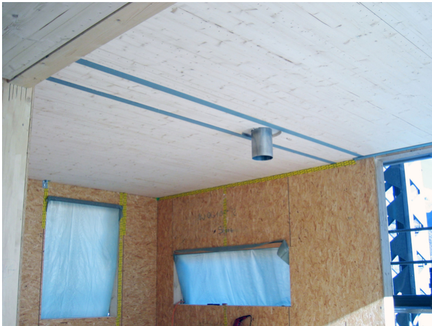
Interior view towards swimmer pool