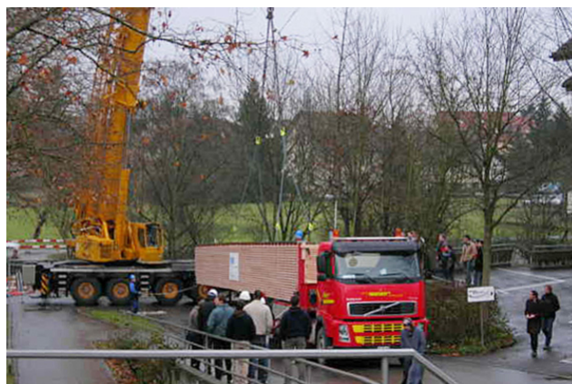
Assembly from truck