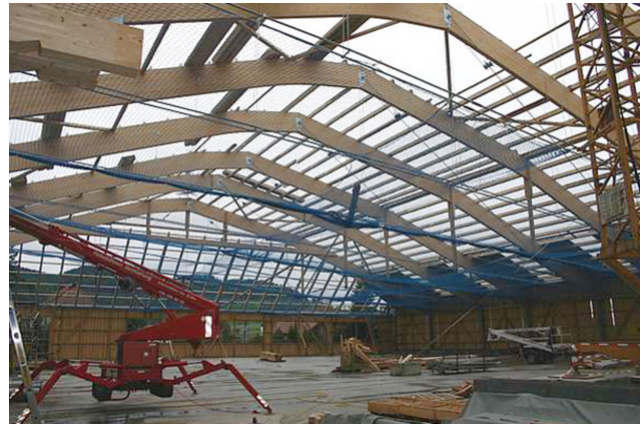
Setting up the binder