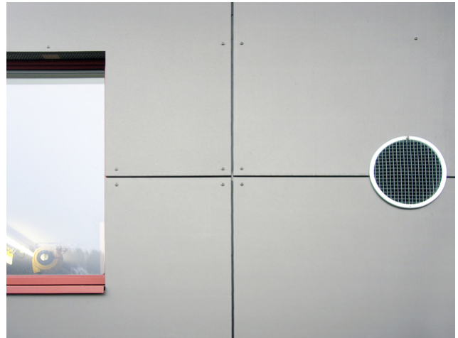
Detail view facade