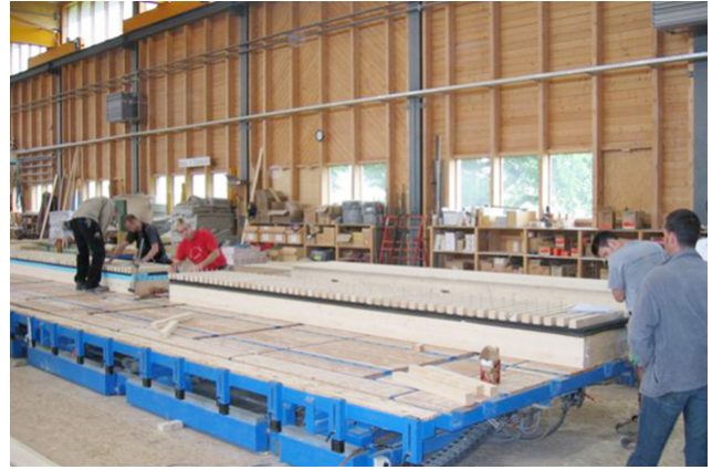
Production of roof elements