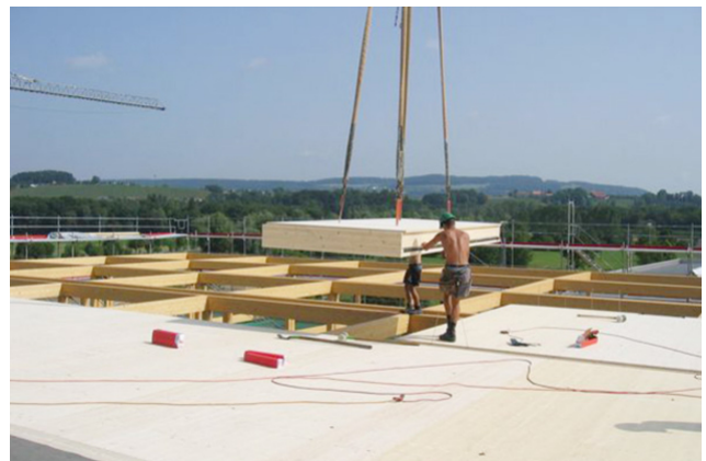
Assembly of roof elements