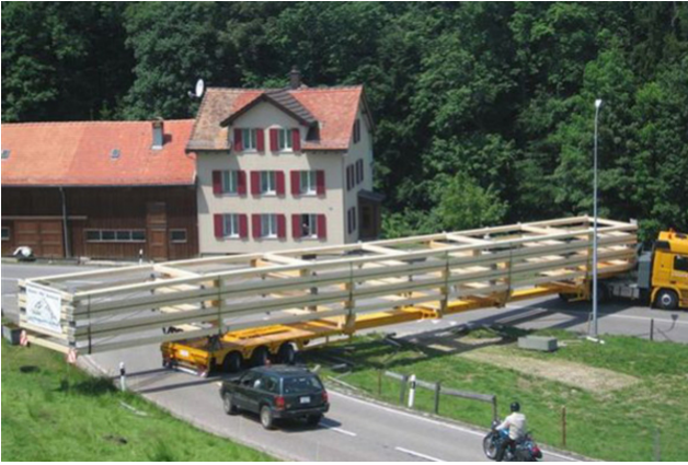
Transportation: It's tight in Appenzellerland