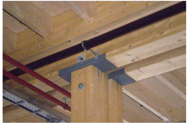
Transverse compression reinforcement with steel U-section, secondary supporting structure on bearing battens