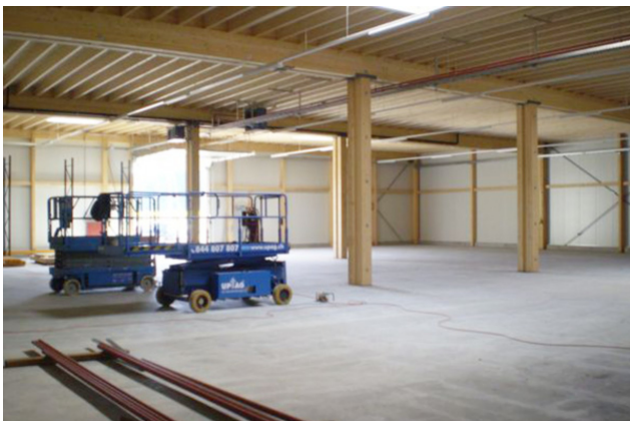
Interior view carcass

Twin girders made of glulam were chosen as the main girders, the girder dimension was 880 x 220 mm. The secondary structure consisted of ribbed slabs, the ribs made of glulam were glued above grade, rib dimension 320/80 mm, thickness of the three-layer slabs 42 mm. Wind bracing was provided by Swiss-Gewi bars arranged diagonally, with loads transferred directly to the foundations. Sandwich panels (d= 100mm) were used as external wall cladding.