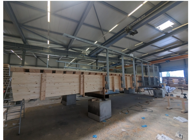
Prefabrication of the bridge in the JPF-Ducret workshops.