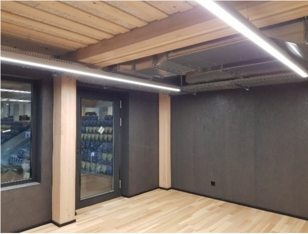
The wood was harvested in winter 18/19