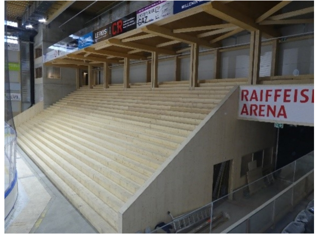
...and processed into building products