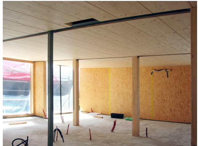
Supports in wood