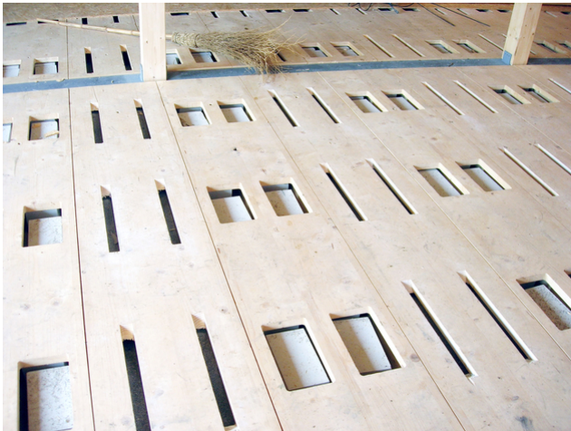
Filling the opening signature silence