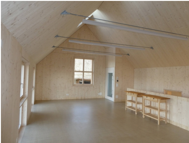
Tie rod for absorbing the static forces