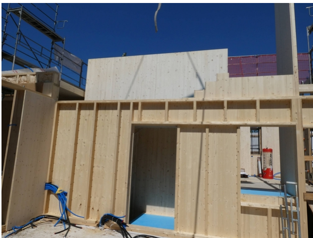
Assembly of wooden construction elements