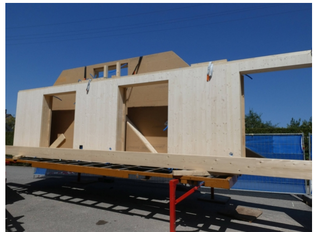
Delivery of the wooden construction elements