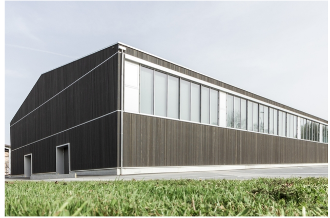
Gymnasium after renovation