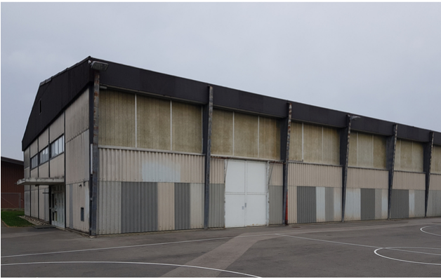
Gymnasium before renovation