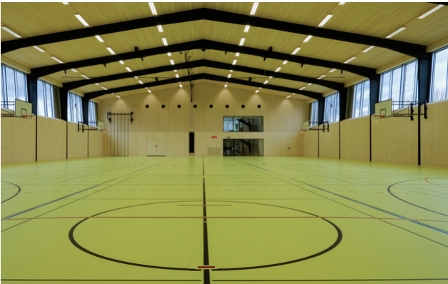
Interior view after renovation