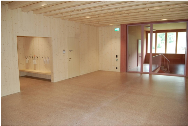
Staircase with wardrobe