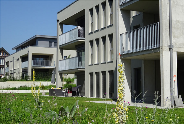
Exterior view finished superstructure