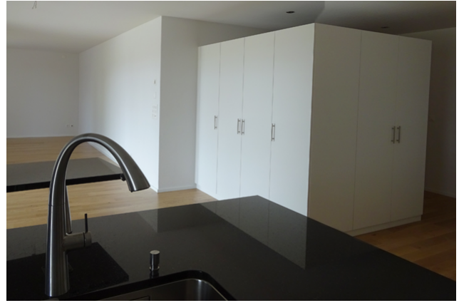
Interior view apartment