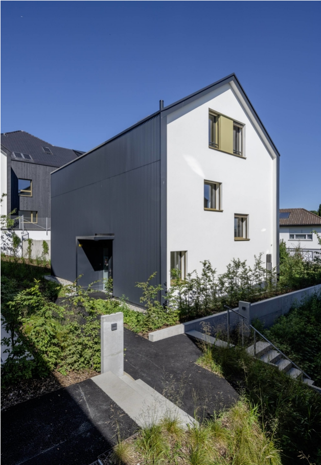
Single family house