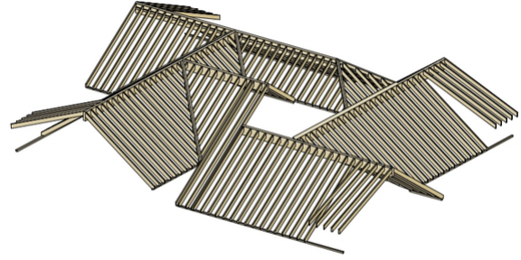
MFH view 3D