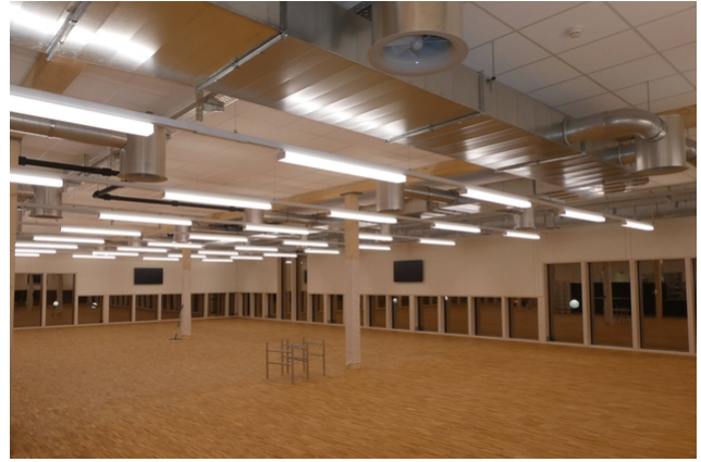
Innenraum vor Einrichtung