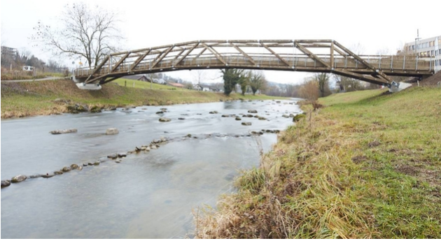
The new Tüfisteg