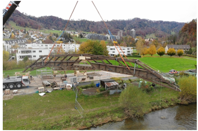
Assembly work on the bridge