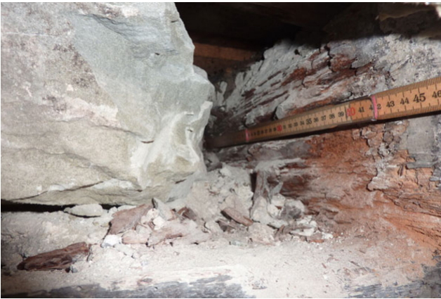
Ceiling beam support in the outer wall in the wine cellar before renovation