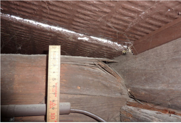
Support for wine cellar beams before renovation