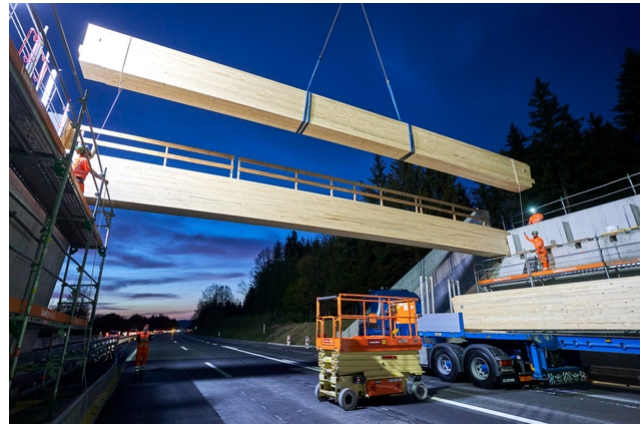
...and are placed in one piece on the concrete foundations.