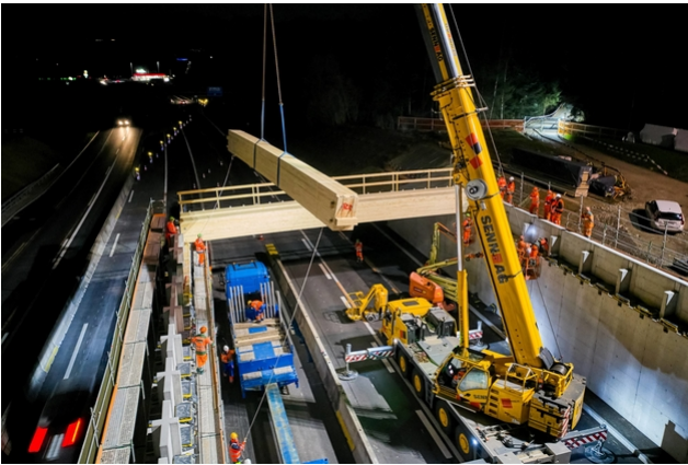
The girders weigh about eight tons...