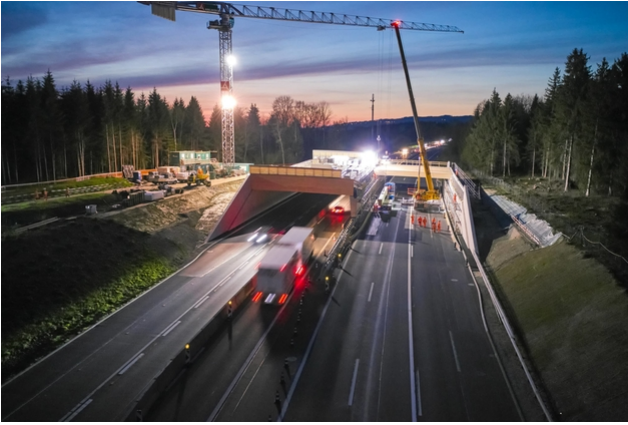
Assembly work with single lane traffic