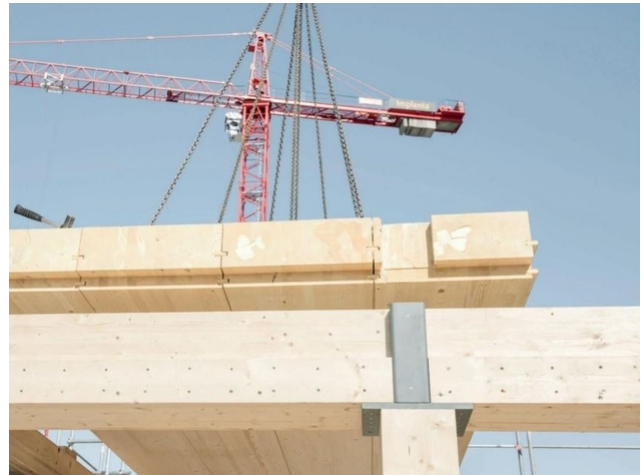
The node: steel parts transfer the load from one support to the next.