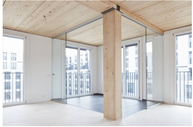
Loggia with supports and ceilings in timber construction