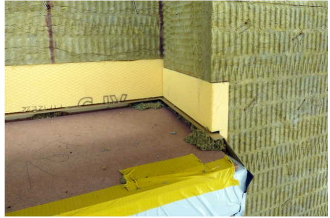
Detail insulation on window sill