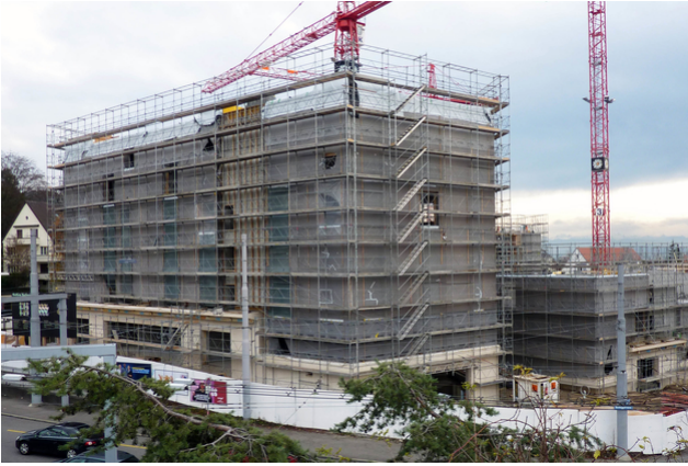
Apartment house with construction site scaffolding