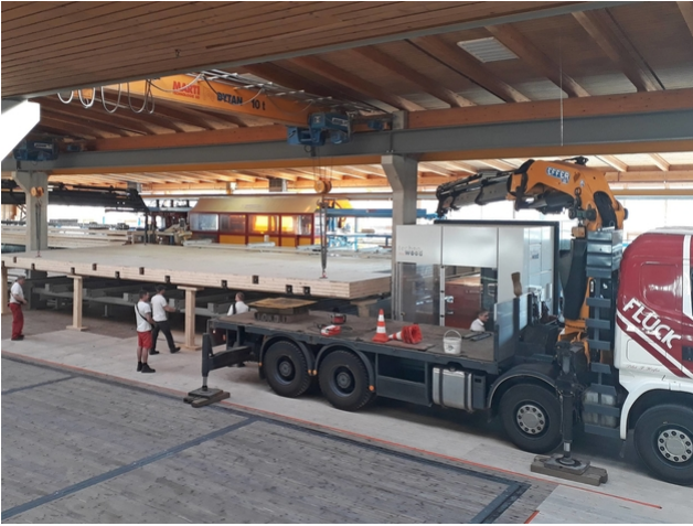
The platform is hoisted to the right place and placed in the hall