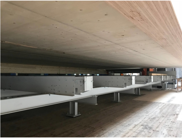
View of the construction of the platform from below