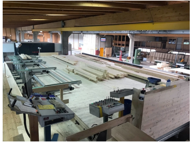
The new working platform offers a lot of space to the woodworkers